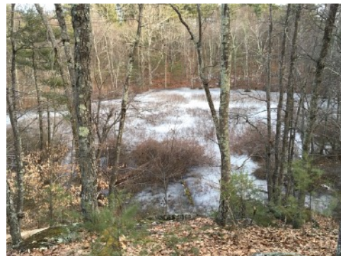
④ Frozen vernal pool from the Overlook

Gould-White: This name has been used for a contiguous group of properties that offer many trails and plenty of scope for exploration. Vernal pools surrounded by hilly woodland, and ledge outcrops lie in the center of this area. Old trees grow side by side with young stands of sweet birch. A number of brooks cross the land. The sights and sounds of wildlife such as deer and woodpeckers are present. A group of rocks has settled into a formation known as “The Cave” ①.