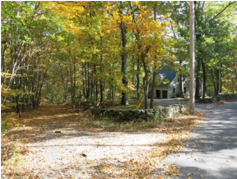
② Sawyer Rd. trailhead