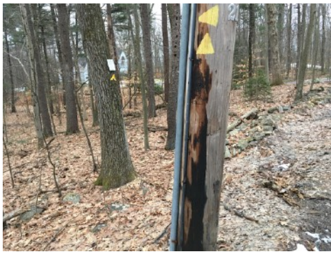
① West Berlin Rd. trailhead