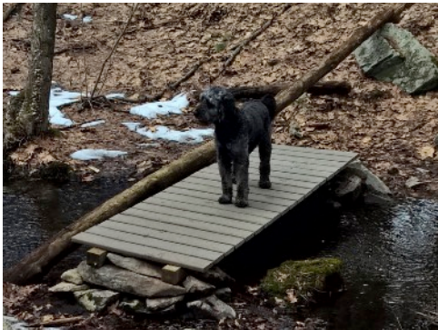
③ White property brook crossing