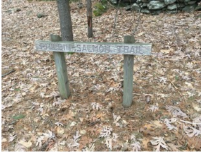
① Philbin Salmon Trailhead