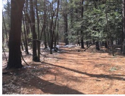
② Philbin Salmon Trail