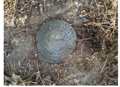
③ Survey mark at summit: highest point in Bolton