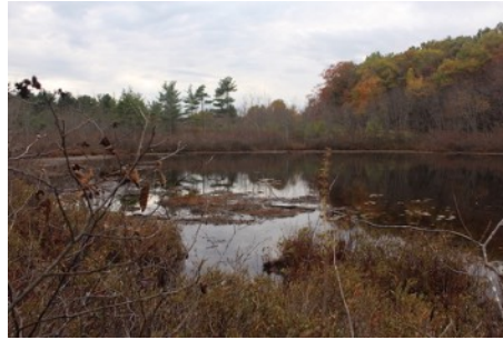
⑤ Welch Pond

Parking: Wattaquadock Hill Rd., Gould Memorial trailhead. 3 cars. 42.423278, -71.637750 Sawyer Road., Haynes- Wheeler trail head.