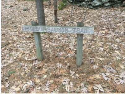
① Philbin Salmon Trailhead