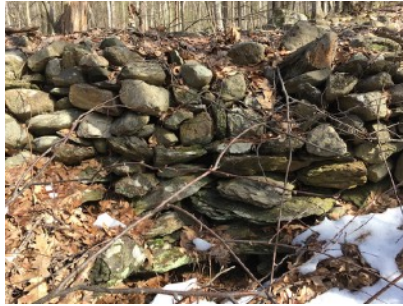
④ Old Stone embankment