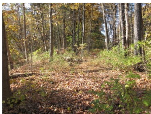
② Trail on the railroad bed