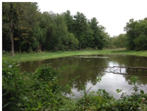
④ Goose Pond in summer

Parking: Main Street/Route 117, 2 cars. 42.446005, -71.629698