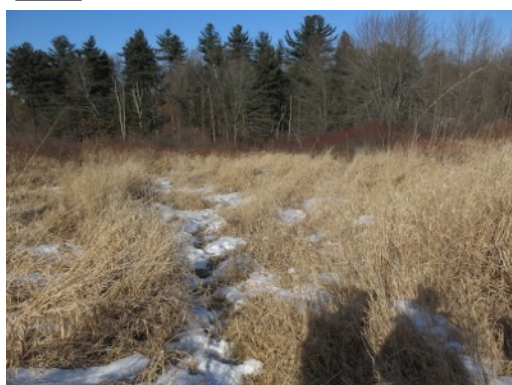
③ The meadow in winter