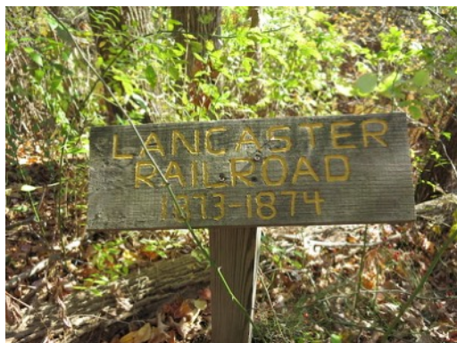
① Railroad bed bridge

Goose Pond Trail: This area was donated to the Town in 2019 as part of the Tadmor residential development. This trail meanders to the cul-de-sac at the end of a private driveway. A sidewalk was created from the development to Forbush Mill Rd.