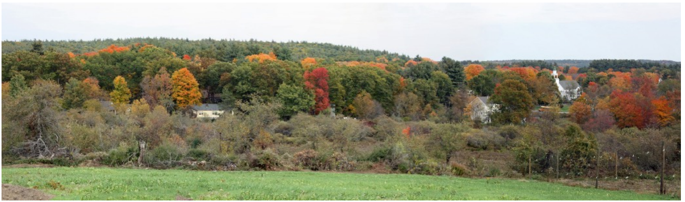
1 Autumn Panorama