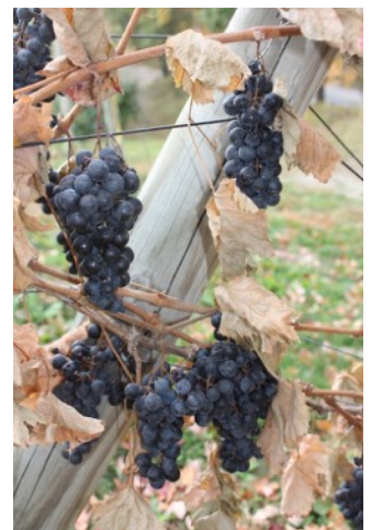
5 Grapes at the winery