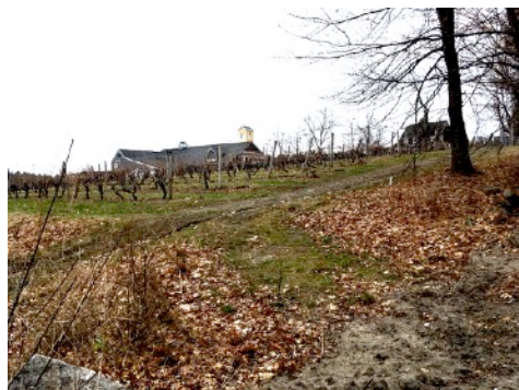
3 Winery buildings