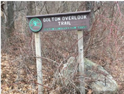
2 Wattaquaddock Hill Rd. Trailhead

Exploration: Bolton Town Center: library, historical society, coffee shop, churches, town hall.