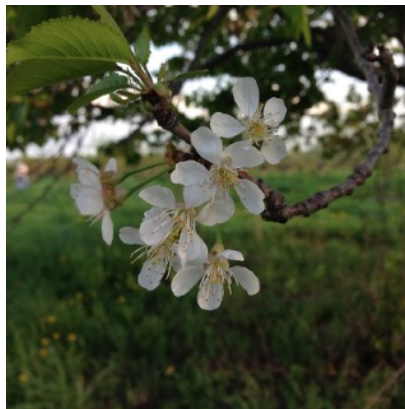
4 Apple blossoms