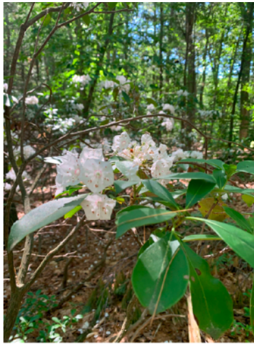
④ Mountain Laurel