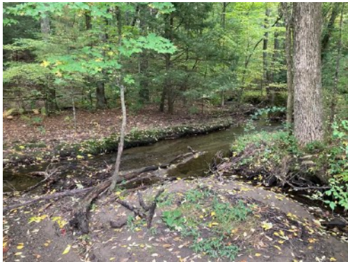
② The Still River, a cold water fishery

Sand Road: Is a seasonally restricted access, and unpaved connection between Forbush Mill Rd. and Old Common Rd. in Lancaster.