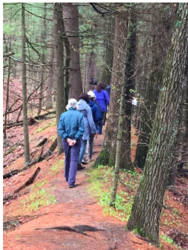
③ Old Lancaster Railroad bed

Connections: Wilder Farm area via the Tadmor sidewalk. From the Taggart trailhead, walk north along Forbush Mill Road past the DPW buildings. The sidewalk is parallel to Route 117 (Main St.) and leads to the Goose Pond Path development. The Wilder Farm trailhead is at the southern end of the road.