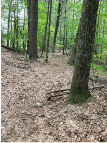
① The cart track

Taggart Property: Bolton acquired 38.5 acres of this property with assistance from the LAND grant program. A further 4.5 acres are land banked for the town’s own use. The area contains some noteworthy features such as a section of the Old Lancaster Railroad bed ③ ( https://boltontrails.org/lancaster-railroad ), wetlands around the perimeter with a vernal pool in a kettle hole at the heart of the land ①, old cart tracks, and interesting forest vegetation such as mountain laurel ④. The topography helps the surrounding land by increasing resiliency from floods.