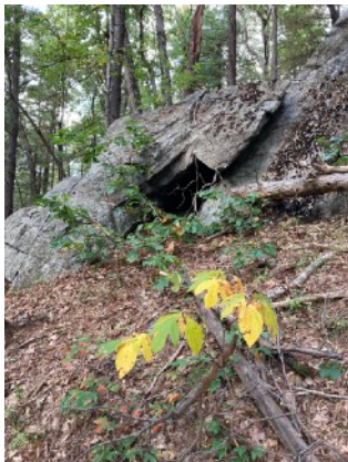
② The “Cave”