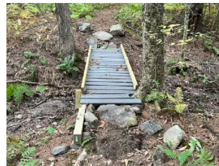
⑥ Crossing a small brook

Ballville Trails: Families called Ball lived in this area before 1790, but this part of town is known mostly as the location of The International Golf course ① , but some of the land used for golf was the location of the Bolton Airport (1932-1952).