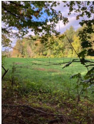
① Townshend Farm Meadow