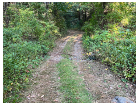
⑤ Track out of the meadows