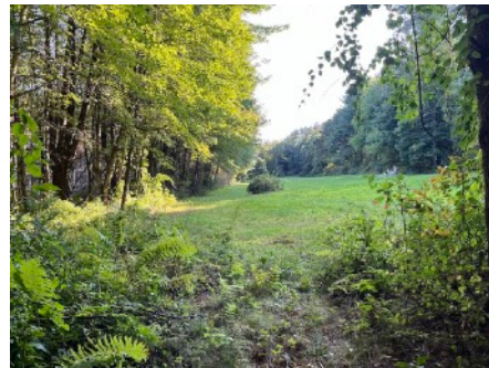
③ Upper Meadow on North Brook Trail