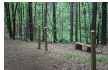
Sullivan Hut site