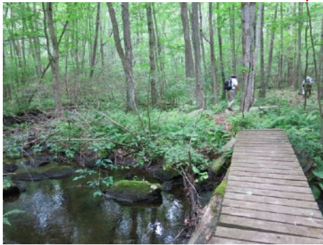
1 The first stream crossing

The Zink Sawmill land: This Town-owned land was once the location of a sawmill owned by the Zink family. There are still remnants of the industrial activity visible from the trail which is a useful connector from Sugar Rd. 1 to the parking area and the Zink Trail Easement on Corn Rd.