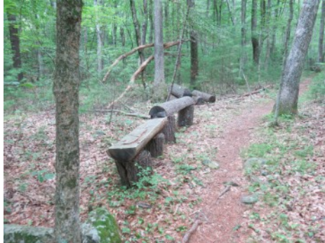
2 Log bench