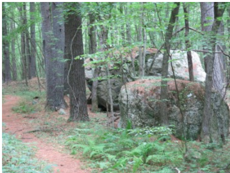
3 Boulder field