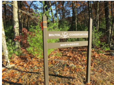
4 Ledgeswood Circle trailhead