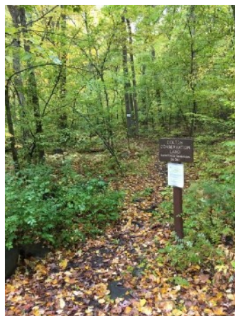
4 Annie Moore Rd. Trailhead