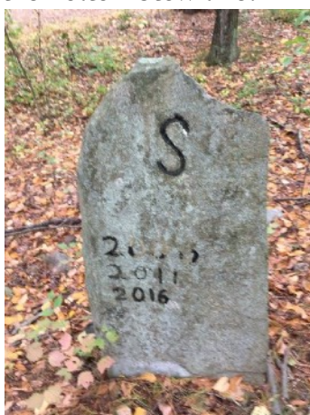
1 Natural Stone Marker