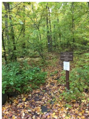
④ Annie Moore Rd. Trailhead