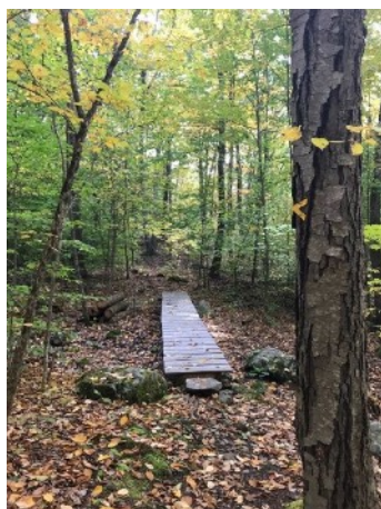
③ Bridge on the longer loop trail