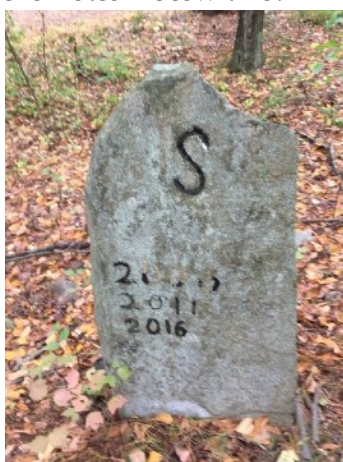
① Natural Stone Marker