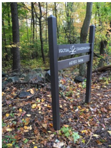
1 Keyes Farm trailhead

Keyes Farm Conservation land: This property is accessed from Hudson Rd./Route 85. The trail is a loop with an approach through woodland. The path crosses the same gas pipeline as the Danforth Brook Trail, but further to the northwest.