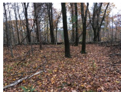
4 Barrett's Hill summit plateau