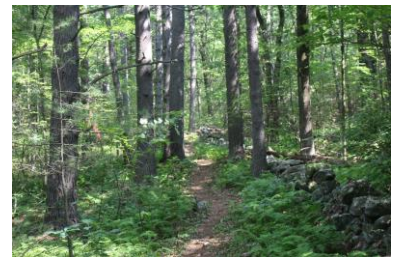
Peach Hill Rd Trail