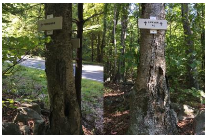
Trail Signs on Tree