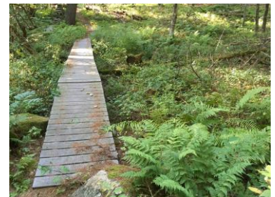
Peach Hill Rd Trail