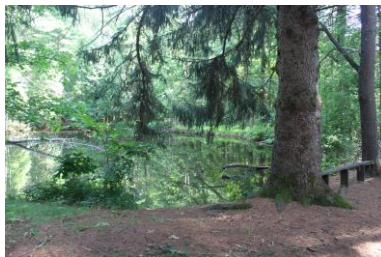
Upper Pond Bench