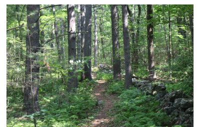
Peach Hill Rd Trail