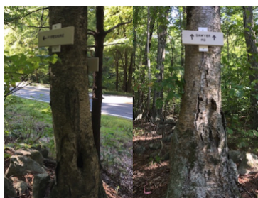
Trail Signs on Tree