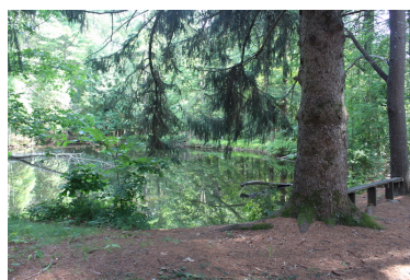
Upper Pond Bench