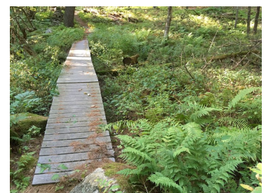
Peach Hill Rd Trail