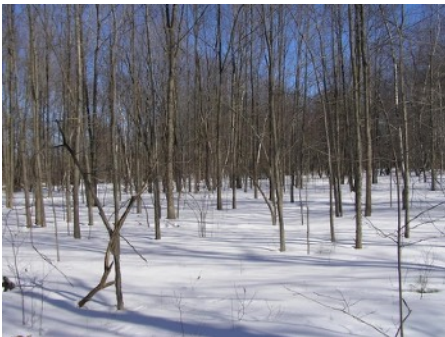
③ Woods in Winter