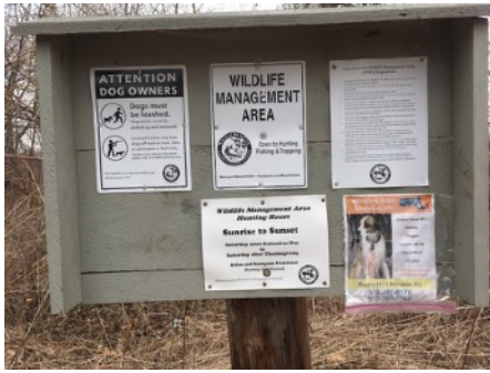
① Kiosk at the 117 entrance near the Lancaster town line.