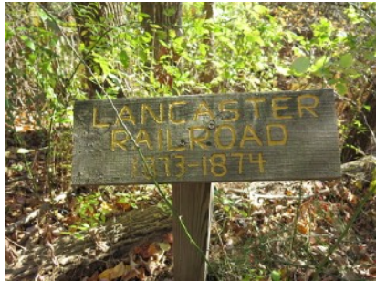
① Railroad Bed Bridge

Goose Pond Trail: This area was donated to the Town in 2019 as part of the Tadmor residential development. This trail meanders to the cul-de-sac at the end of a private driveway. A sidewalk was created from the development to Forbush Mill Road.