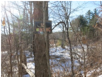
④ Railroad embankment