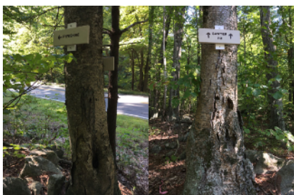
Trail Signs on Tree