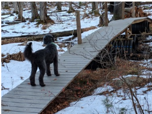
5 "The Big Bridge" - High enough for Beaver flooding

Parking: There is a large parking area off Flanagan Road. GPS address 44 Flanagan Road.