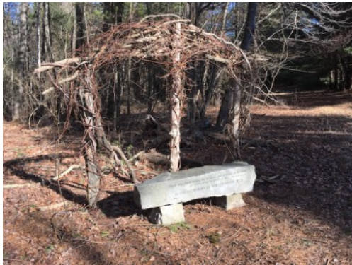
2 Memorial Bench