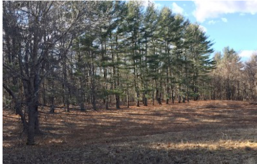
1 Allee from the North Meadow

Bowers Springs: One of Bolton's most popular conservation areas, Bowers Springs is a wonderful place for picnics, nature walks and cross country skiing. It is especially popular with dog-walkers and a dog waste bag station and disposal bin are located at the Flanagan Road parking area. Though there is no swimming permitted in either of the two man-made ponds, skiing is allowed in winter months. In addition to the ponds, the area features an expansive meadow and a large woodland which extends into Harvard 1 . Dog walkers, hikers, joggers, skiers and horseback riders all share the same well-marked trails. The trails connect to Vaughn Hills in Bolton and other conservation lands in Harvard (see the Harvard trail maps https://harvardconservationtrust.org/trails/ ). This whole connected conservation area was a joint purchase by the Town of Bolton and the Town of Harvard in 1973. Bowers Springs is also the site of the Tom Denney Nature Camp an outdoor program for local children sponsored by Bolton Conservation Trust.