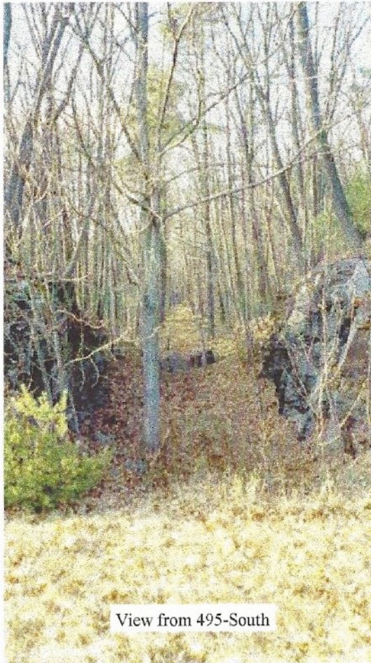
View from 495-South

By: Rachel Nichols Girl Scout Gold Award Project 2000