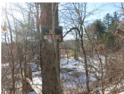
④ Railroad embankment