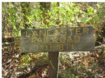
① Railroad Bed Bridge

Goose Pond Trail: This area was donated to the Town in 2019 as part of the Tadmor residential development. This trail meanders to the cul-de-sac at the end of a private driveway. A sidewalk was created from the development to Forbush Mill Road.