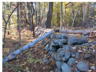
③ The trail loops around a wall near the pond