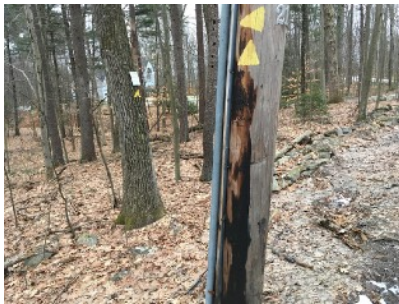
1 Hapgood-Schecter trailhead on West Berlin Rd.

Longer - Start at the White Property sign on Randall Rd, follow the path to the junction on the cart track, turn left, then right along the Brendan Ridge Trail, make a right turn to visit the Overlook, continue to the Hapgood-Schecter Trail and back via the grove of young trees (sometimes called the “Filtered Forest”) and the Basin loop Trail.