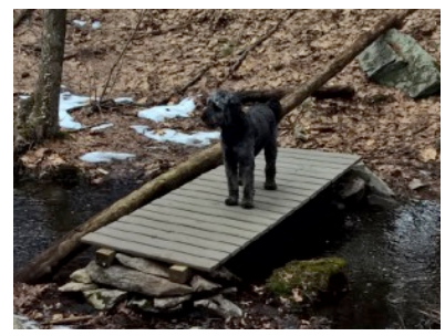
3 Crossing the brook on the White property.