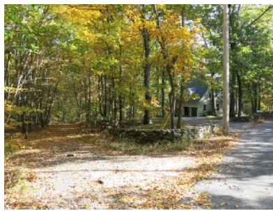
2 Sawyer Rd trailhead.