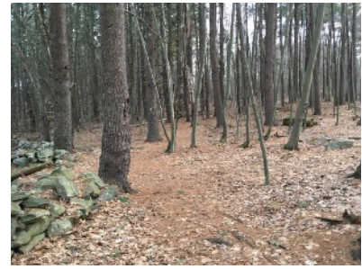
6 Trail towards the Birch Grove from the north.