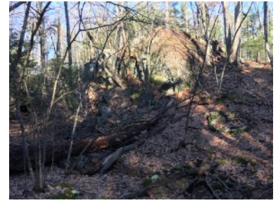
⑥ Prominent cliff near the Trail