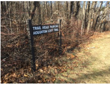
① Trail Head with Parking