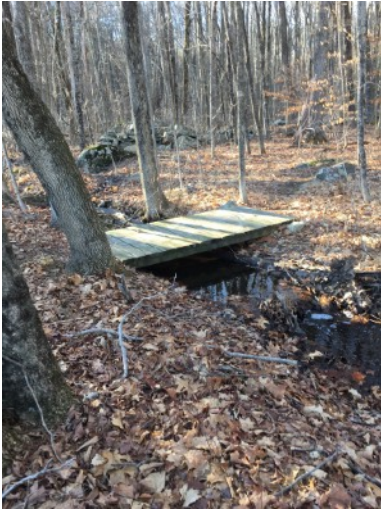
② Bridge crossing the Brook near the Trailhead