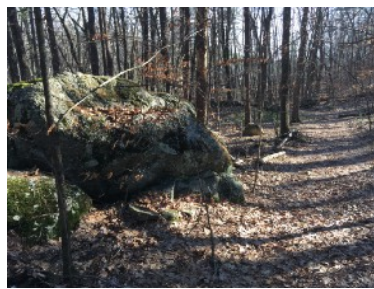
⑤ Big Stone at a Trail Junction