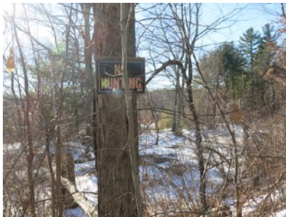
④ Railroad embankment