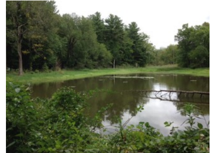
⑥ Goose Pond in Summer

Parking: Main Street/Route 117. 42.446005, -71.629698