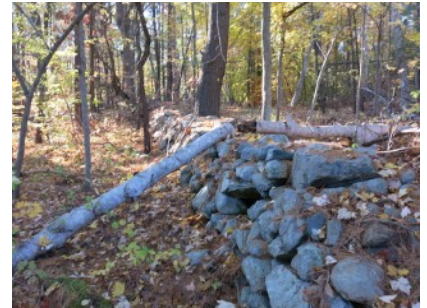
③ The trail loops around a wall near the pond