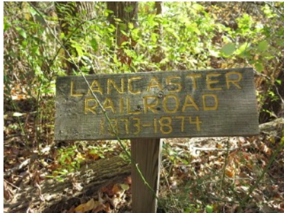
① Railroad Bed Bridge

Goose Pond Trail: This area was donated to the Town in 2019 as part of the Tadmor residential development. This trail meanders to the cul-de-sac at the end of a private driveway. A sidewalk was created from the development to Forbush Mill Road.