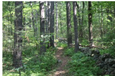
3 Peach Hill Rd Trail