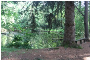
2 Upper Pond Bench