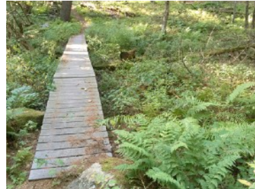
6 Peach Hill Rd Trail