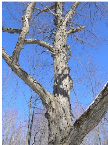
5 Shagbark hickory in Winter

Suggested walks: Short and Medium - Start at 3 and explore the trails towards Harvard. Although this is a flat trail, it is subject to seasonal flooding. Very long - The western end of the incomplete Bolton Loop Trail lies at the Red Barn (388 Still River Rd.) parking lot.