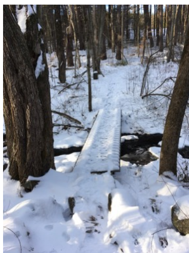
2 Winter brook crossing.