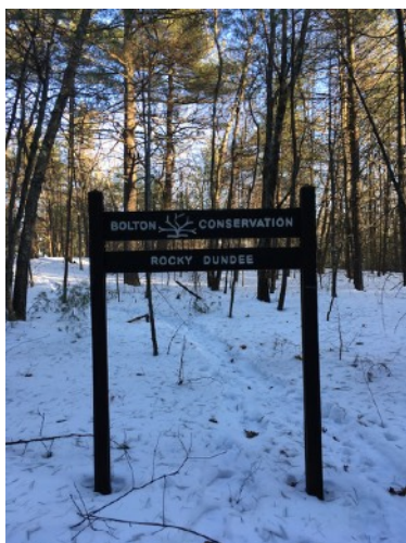
1 Randall Rd. sign.

Rocky Dundee: This Conservation Area is Town of Bolton open space as a result of the FOSPRD (Farming and Open Space Residential Development) on Rocky Dundee Rd. Much of this extensive land is swamp and a safe refuge for many forms of wildlife. The trail from Randall Rd. offers a pleasant walk through woodland beside a stream, crossing over a brook on a recently constructed bridge, and following a meandering series of bog bridges over rocks through a wet area.