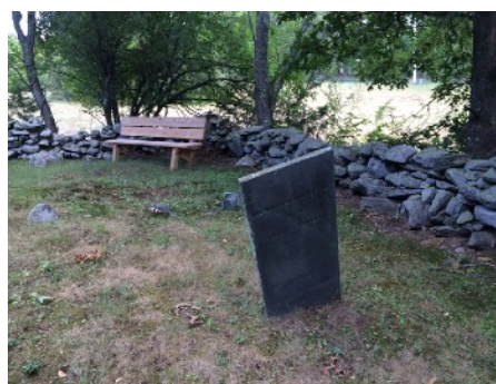
5 The Old Fry Burying Ground.

Connections: Trails lead to the Gould-White area ( Map 11 ) where there is an extensive network of paths on varied terrain with vernal pools, a small cave, and connections to Sawyer and West Berlin Roads.