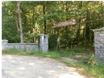
5 Entrance Gateway