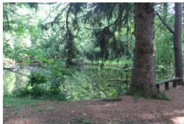
2 Upper Pond Bench