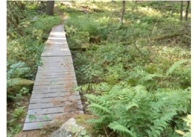
6 Peach Hill Rd Trail