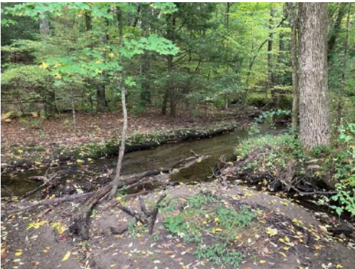
② The Still River, a cold water fishery

Sand Road: Is a seasonally restricted access, and unpaved connection between Forbush Mill Rd. and Old Common Rd. in Lancaster.