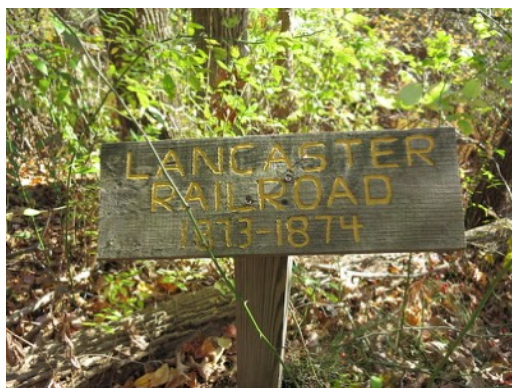
① Railroad bed bridge

Goose Pond Trail: This area was donated to the Town in 2019 as part of the Tadmor residential development. This trail meanders to the cul-de-sac at the end of a private driveway. A sidewalk was created from the development to Forbush Mill Rd.