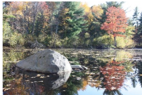
4 Fall colors at the Lower Pond