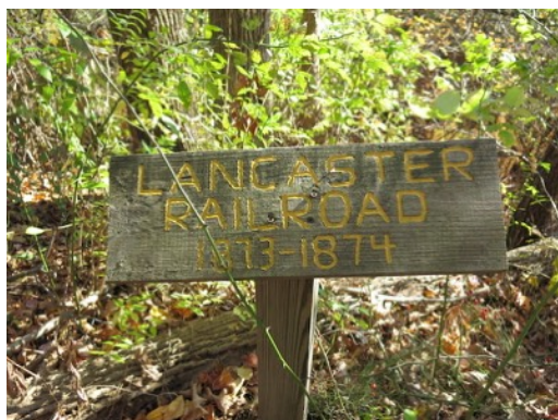
① Railroad bed bridge

Goose Pond Trail: This area was donated to the Town in 2019 as part of the Tadmor residential development. This trail meanders to the cul-de-sac at the end of a private driveway. A sidewalk was created from the development to Forbush Mill Rd.