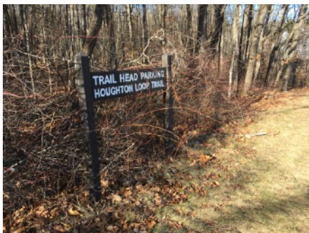
① Trail Head with parking