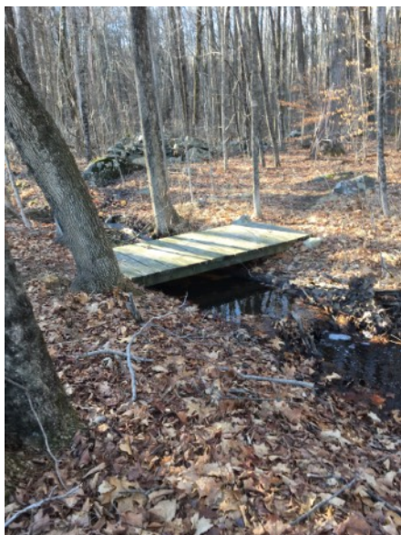
② Bridge near the Trailhead

This is a pleasing area for a quiet stroll in the woods on rolling terrain with some points of interest along the way. The main trail forms a “lollypop” shape with a number of side trails leading to private land and property owned by the New England Power Company; please stay within the area shown on the map.