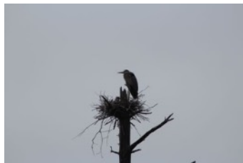
Heron on nest