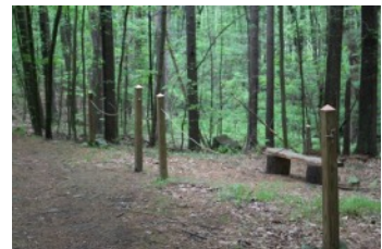
Sullivan Hut site