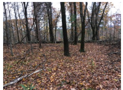
4 Barrett's Hill summit plateau