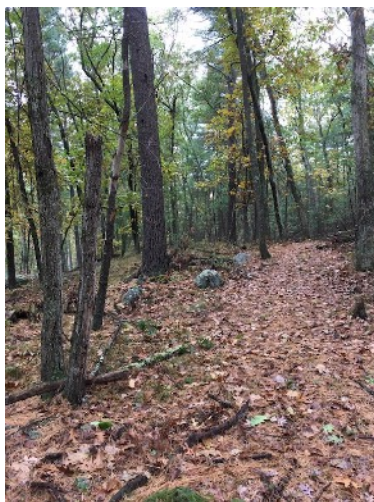
2 Keyes Farm trail