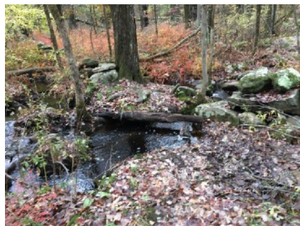
3 Danforth Brook stepping stones

Rolling - start at the Keyes Farm parking area and follow the arrows on the trail (1.0 miles).