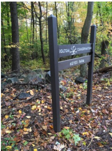
1 Keyes Farm trailhead

Keyes Farm Conservation land: This property is accessed from Hudson Rd./Route 85. The trail is a loop with an approach through woodland. The path crosses the same gas pipeline as the Danforth Brook Trail, but further to the northwest.