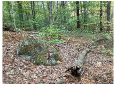
③ North Brook Valley