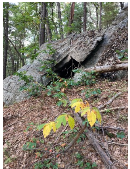
⑤ The “Cave”

Suggested walks: A complete loop of the of the Oak Trail Circuit