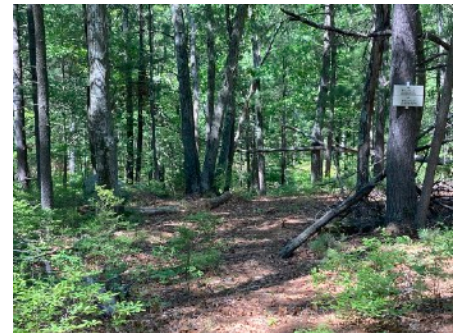
④ Upper and Lower Trail junction

Ballville Trails: A Neighborhood called Ballville appeared on a map in 1998. Families called Ball lived in this area before 1790. In 1831 two families named Ball were living next to each other on Ballville Rd. This part of town is known by most people as the location of The International Golf course ②, but some of the land used for golf was the location of the Bolton Airport (1932-1952).