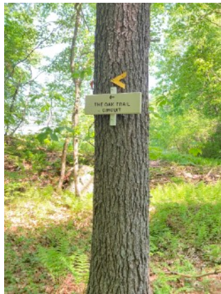
② Sharp turn