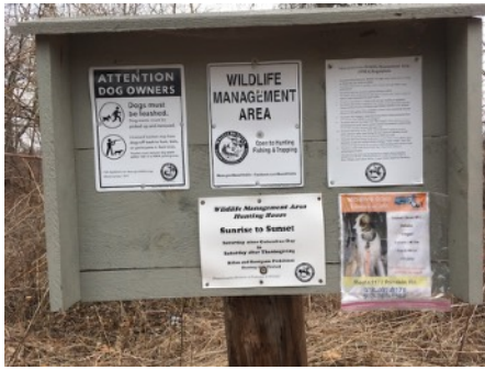
① Kiosk at the 117 entrance near the Lancaster town line.