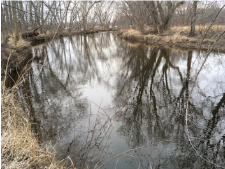
② Nashua River