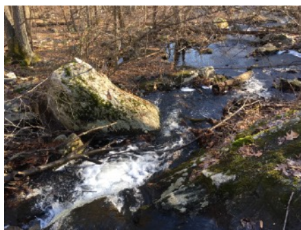
④ Looking south along the Brook