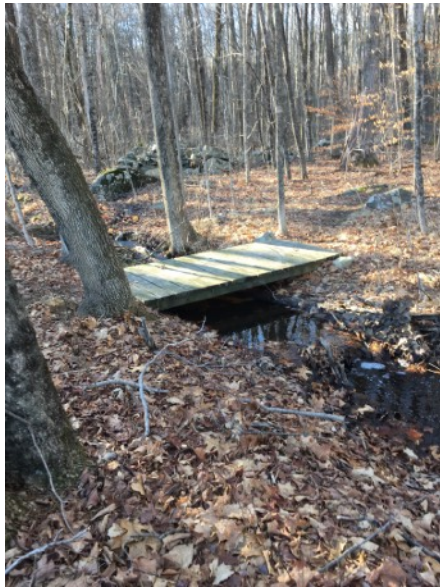
② Bridge near the Trailhead

This is a pleasing area for a quiet stroll in the woods on rolling terrain with some points of interest along the way. The main trail forms a “lollypop” shape with a number of side trails leading to private land and property owned by the New England Power Company; please stay within the area shown on the map.