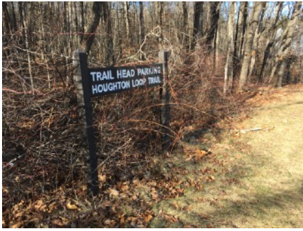
① Trail Head with parking