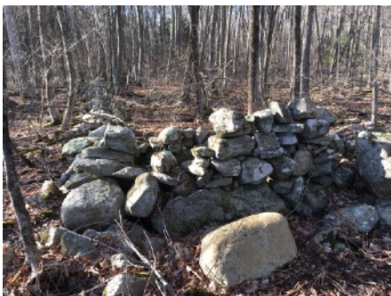
③ Stone structure near the trailhead

Suggested walks: All of the paths are worth a visit, and with a total mileage of 1.0 mile the whole area can be visited without too much effort in a fairly short time. The path to the east of the old cart track ① that runs up the middle of the main loop has some good views of the nearby rocky outcrops and the small brook that runs below them. These quiet paths break away from the cart track near a large boulder.