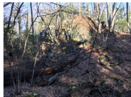
⑤ Prominent cliff near the Trail