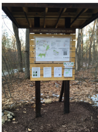
② Bolton Woods Way trailhead