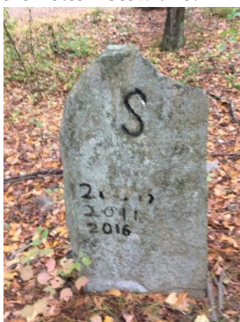
① Natural Stone Marker