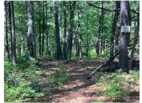
④ Upper and Lower Trail junction

Ballville Trails: A Neighborhood called Ballville appeared on a map in 1998. Families called Ball lived in this area before 1790. In 1831 two families named Ball were living next to each other on Ballville Rd. This part of town is known by most people as the location of The International Golf course ②, but some of the land used for golf was the location of the Bolton Airport (1932-1952).