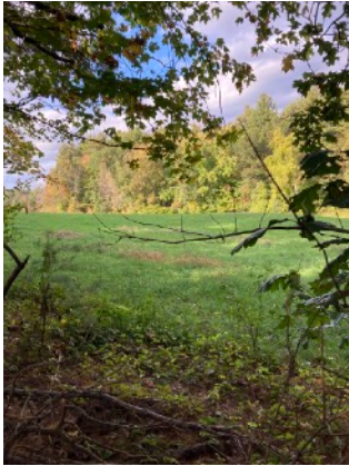
① Townshend Farm Meadow