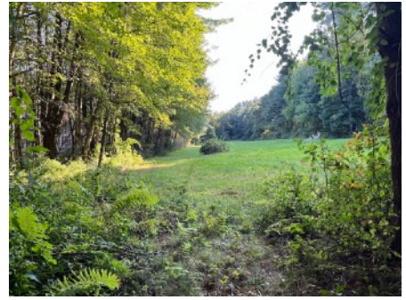
③ Upper Meadow on North Brook Trail