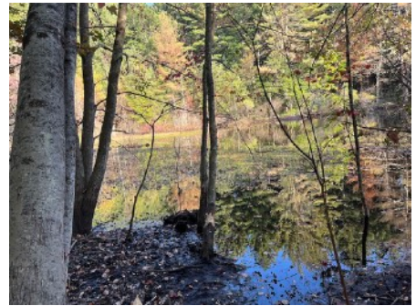
④ Pond on North Brook