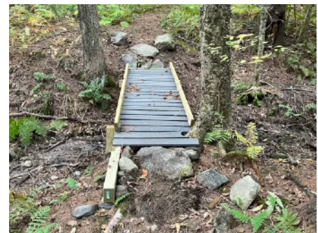
⑥ Crossing a small brook

Ballville Trails: Families called Ball lived in this area before 1790, but this part of town is known mostly as the location of The International Golf course ①, but some of the land used for golf was the location of the Bolton Airport (1932-1952).