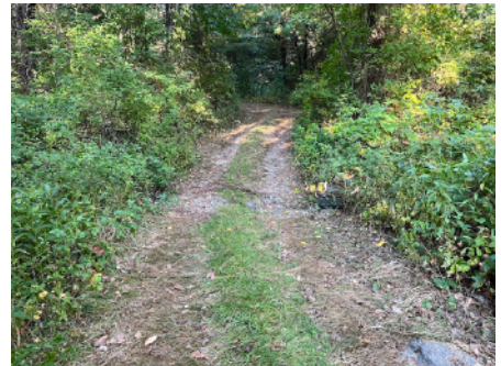
⑤ Track out of the meadows